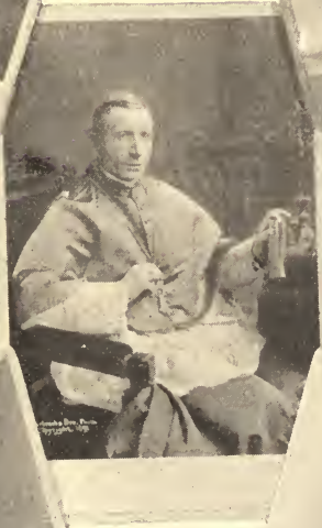
ARCHBISHOP IRELAND, ST. PAUL.